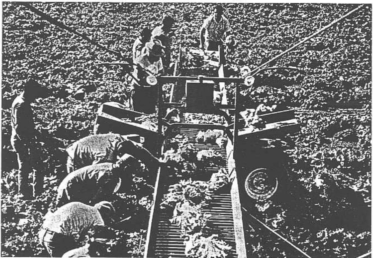
MAN AND MACHINE