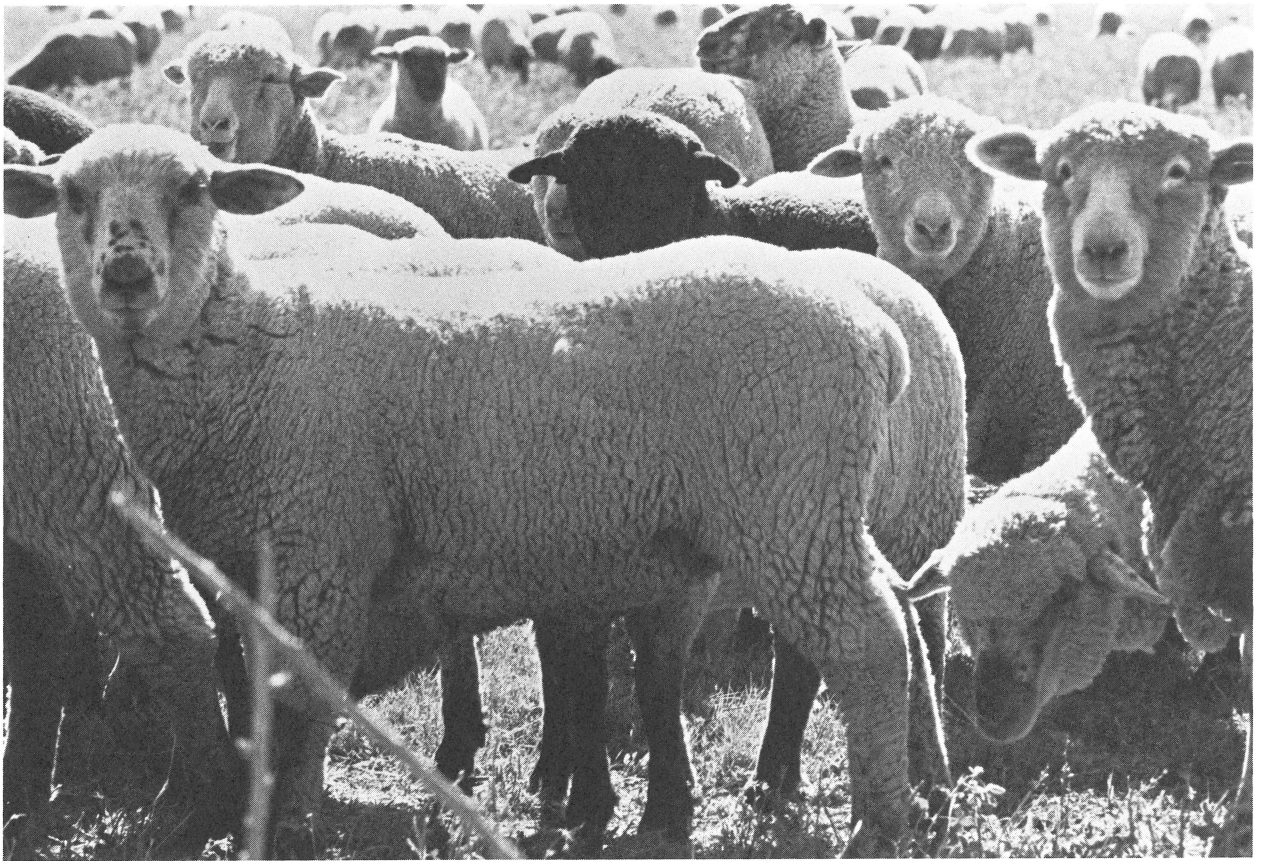
LAMB AND WOOL PRODUCTION